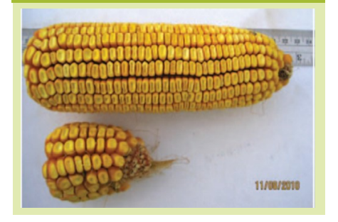
Figure 3: Early symptoms of arrested ear on bottom cob.