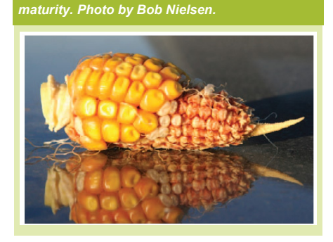
Figure 1: Typical arrested ear symptoms at

Research done at Purdue University shows clearly that the more products get mixed in the application the greater the arrested ear percentages (figure 4). The full article can be see at: <u>http://www.kingcorn.org/news/articles.08/</u> <u>ArrestedEars-1209.html</u>